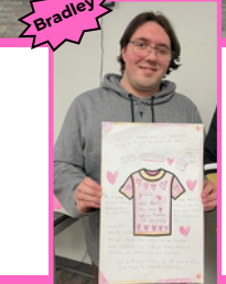
Visual Appeal Most Creative Best Message

ON March 9 LINX will find out if we receive an Award at the 2024 Gala Leduc, Nisku, Wetaskiwin & Devon Regional Chamber of Commerce